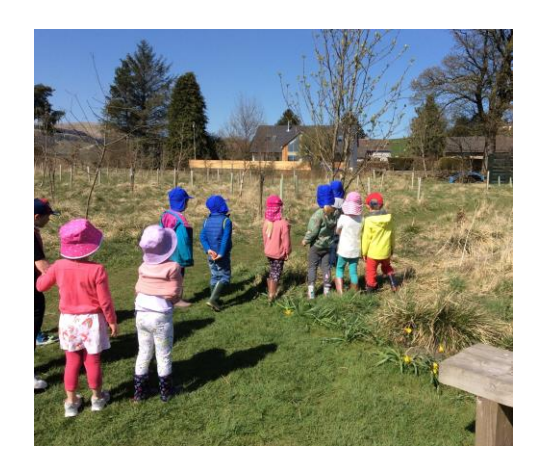
Exploring local woods

We want children to develop the confidence and independence to explore and enquire, to try something new, to ask questions and to seek answers and to apply their learning to discover and learn even more.